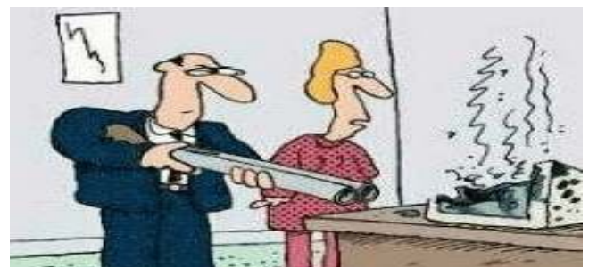
"There are better ways to log out."

T his is available in the Sacred Church gathering space. It contains Mass readings and daily Lenten spiritual reading and other articles of interest.