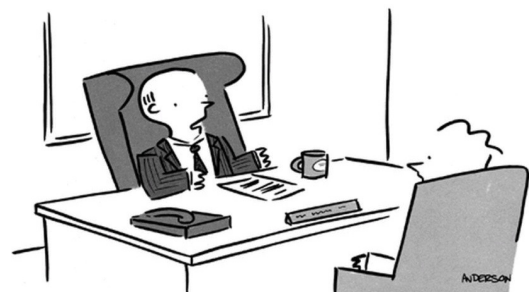
"We're looking for a bold and innovative solution, but I'd settle for a way out of this mess."

We will have a couple issues of this newspaper available in the church entrance to check on parishioner interest.