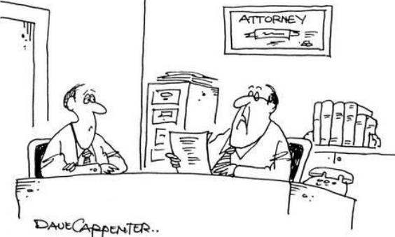
"Get you off? You'll be lucky if I can defend you with a straight face!"

Sacred Heart Parish Council will meet on Tuesday, July 20, at 7:00 pm in the parish hall. Support materials are available in the sacristy for Council members.