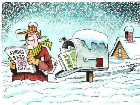
DAVE GRANLUND © www.davegranlund.com

Please turn in your Rice Bowls. You may also give online at www.crsricebowl.org/give .