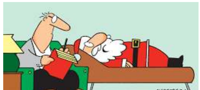
"It's hard to be jolly when you have to work on Christmas."

W e will be using Today's Missal for all of the hymns until we get the projector fixed. Internet service is not working either. That means Livestream Masses and office email is not working. We'll let you know when it does.