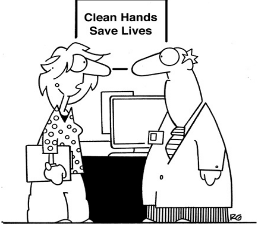
"I use so much alcohol-based hand sanitizer, my hands had to join a 12-step program!"

S acred Heart Parish Council will meet on Tuesday, July 20, at 7:00 pm in the parish hall. Support materials will be made available prior to the meeting.